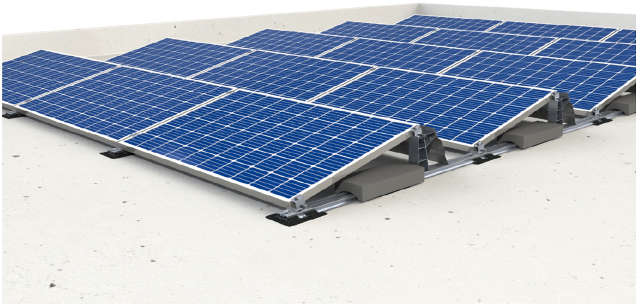
Figure 1: Array assembly of the “ISOFLAT S13” solar ballasted roof mount system with a module tilt angle of 13°

The “ISOFLAT S13” solar ballasted roof mount system consists of solar PV panels which are tilted south at 13deg and is depicted in Figure 1 and Figure 2. Solar modules are in landscape orientation with chord lengths ranging between approximately 950 mm to 1050 mm. The system may be equipped with additional side wind deflectors.